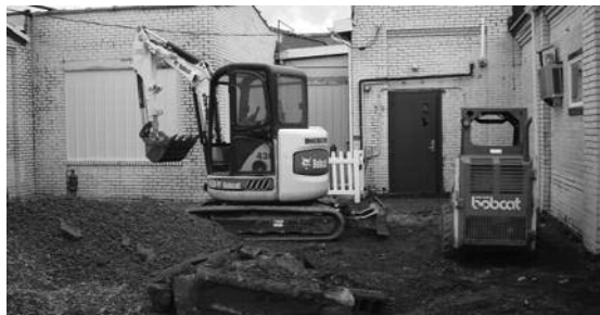
Under Construction! Thanks to the $10,000 grant from Alcoa Foundation, Kawneer, the ATF courtyard was concreted, making the area much safer for everyone to use. The ATF program has been under construction inside and outside. Stop by to see the courtyard, restructure of the program and meet the new staff.