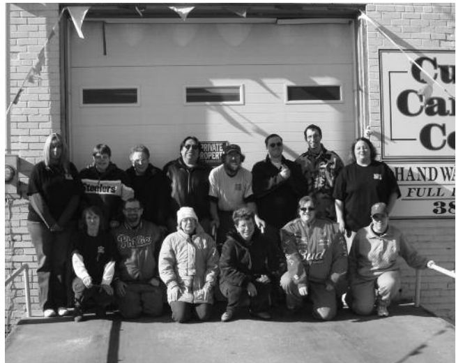
Our Car Wash crew guarantees their work!